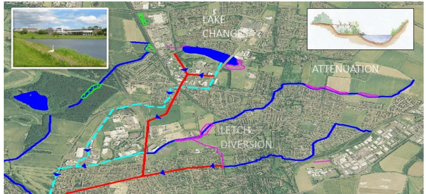
Figure E-4 - Killingworth & Longbenton scheme location

Northumbrian Water successfully applied directly for GIA funding as part of the NIDP. It has also been estimated, that to provide the same level of storage in below ground tanks and upsizing sewers for this